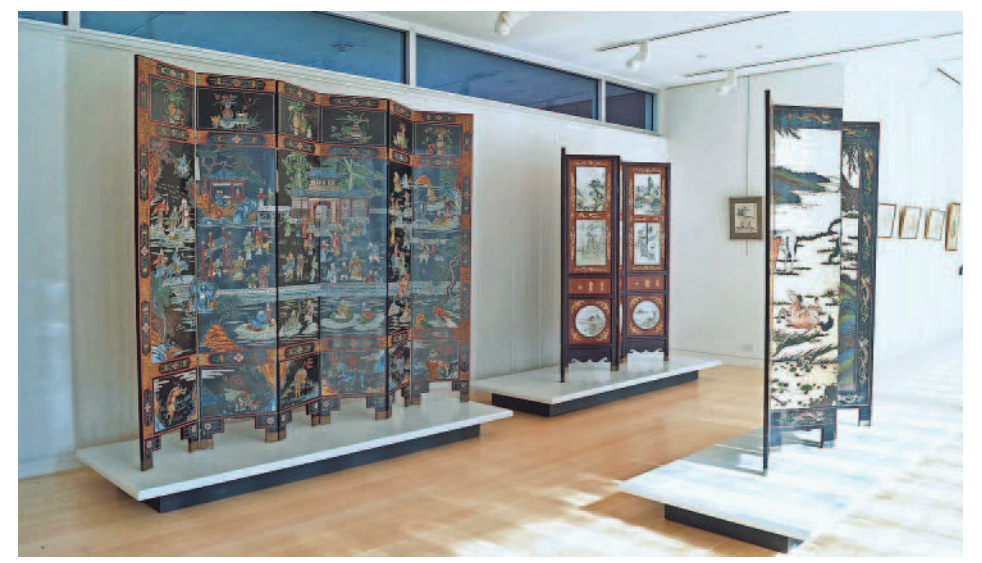
The Elling Eide Center in Sarasota County is a 17,000-square-foot research center and archive. It houses the large archive of art and ancient Chinese literature collected by Eide, who died in 2012.