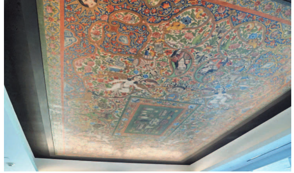
This Persian tapestry is installed in the ceiling of the dining room in the Eide Center, in keeping with Elling Eide's wishes. HAROLD BUBIL