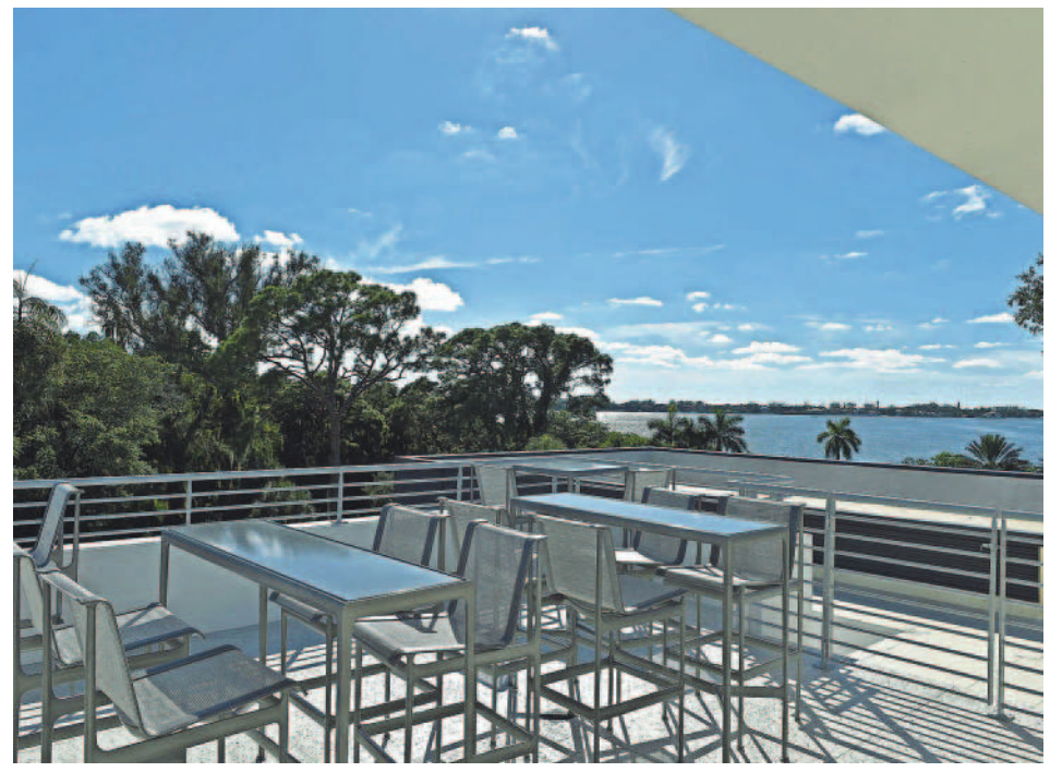
The Eide Center's rooftop overlooks the Intracoastal Waterway and Siesta Key.