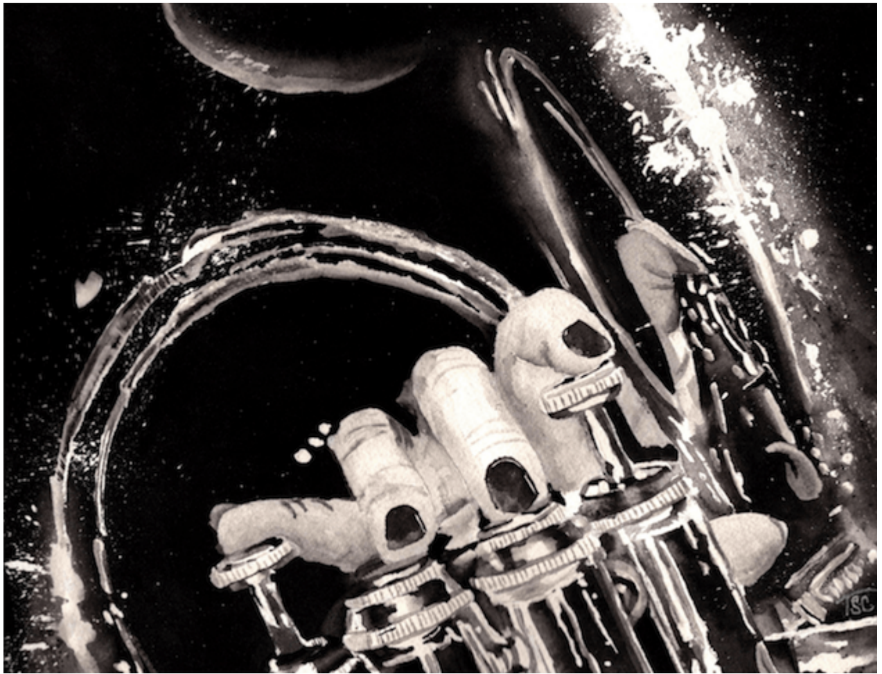
Orchestral Manoeuvres by Tam- Tam