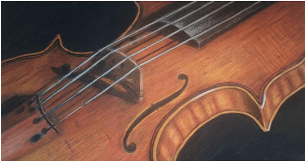
Orchestral Manoeuvres by Cribet