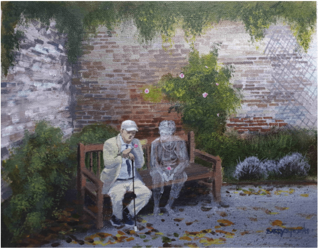
The Bench in the Corner of the Garden by BarryR

Aside from the winners, there are 10 critiques chosen at random. Even if your entry wasn't selected for critique this time, you can learn a lot from the feedback on other artwork.