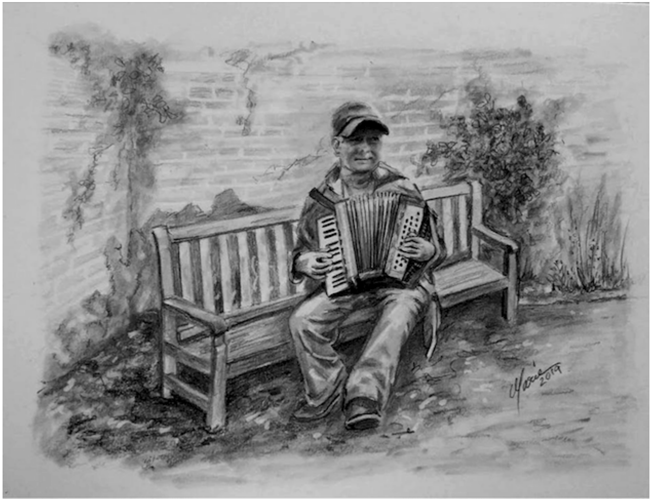
The Bench in the Corner of the Garden by Muriel44