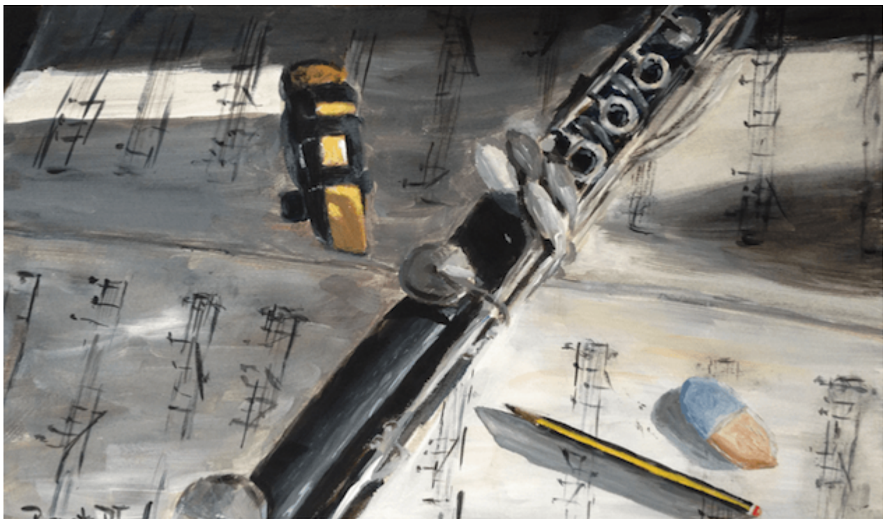
Orchestral Manoeuvres by Renatad