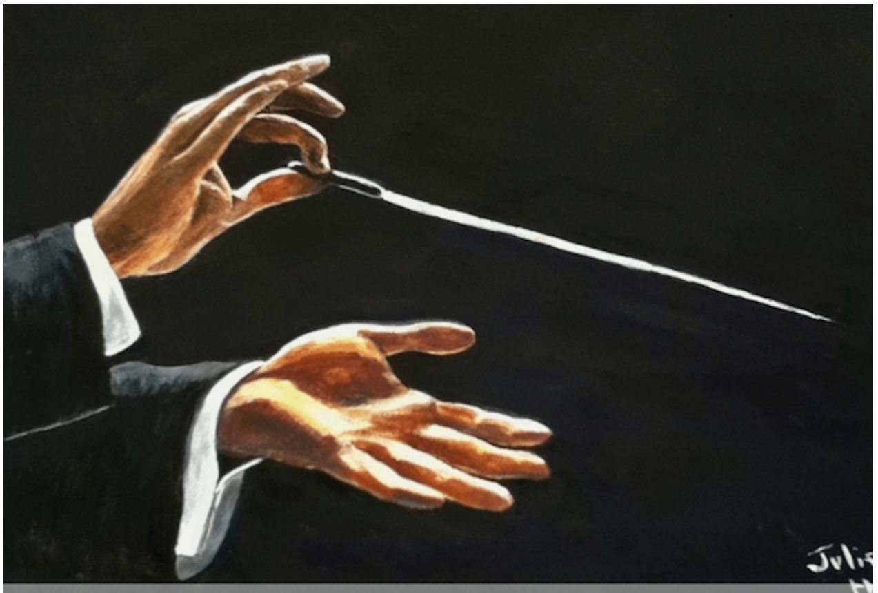
Orchestral Manoeuvres by Jules2