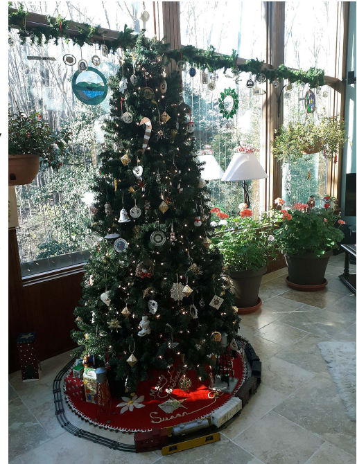
Our 2020 Christmas Tree