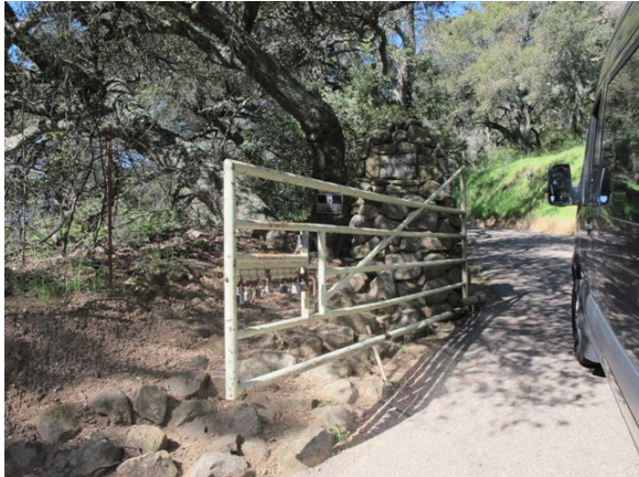
8 Lock Gate off the Mountain Access Road

The 8 lock gate is still there, however, Rancho del Cielo's lock has been replaced by a remote control bolt.