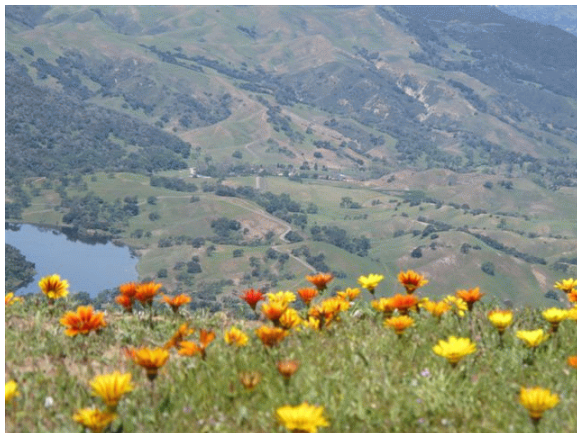
Garanja Flowers in place of the Helicopter Pad

The helicopter pad was replaced by a field of Garania flowers at the Reagan's request after he left office.