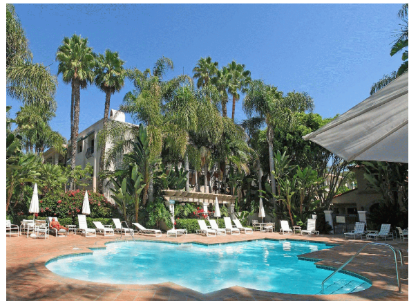
El Escorial Villas Pool

The road up the mountain is still narrow and in terrible condition.