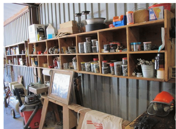
President Reagan's Misc Food Jars filled with important working hardware - nuts, bolts, screws, etc.