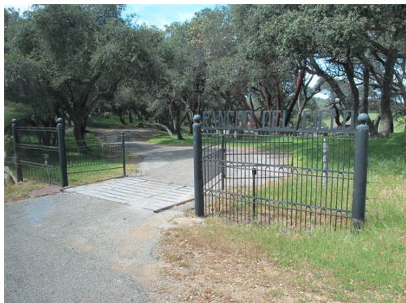
Main Gate to Rancho del Cielo

The helicopter pad was replaced by a field of Garania flowers at the Reagan's request after he left office.