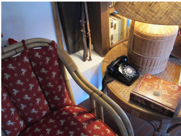
A WHCA Phone - - No Dial Tone!!