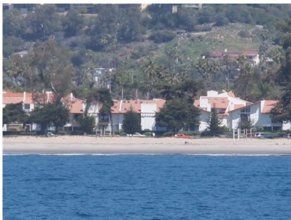
El Escorial Villas Viewed from the Harbor

The El Escorial Delux Hotel (which provided us accommodations; and served as our nerve center and communications center) is no longer a hotel, but rather El Escorial Villas.