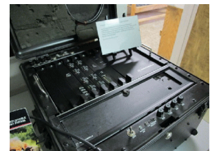
WHCA Provided Secret Service Radios