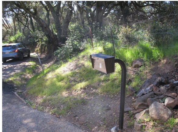
Rancho del Cielo Remote Gate Opener