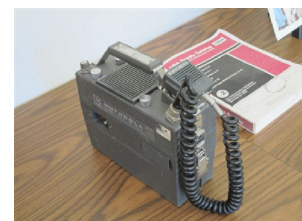
Old Faithful Brick